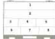
Bin Diagram Place parts in bins...

Address kit location at www.products.kits.com or contact a TE Connectivity authorized distributor